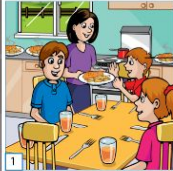
Fred loves food